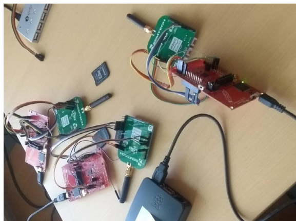
FIGURE 1 LoRa integrated within the Contiki-NG IPv6 networking stack